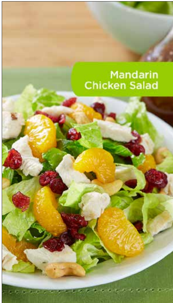
Mandarin Chicken Salad

DELI HOURS 6:30am – 9pm | STORE HOURS 6:30am – 11pm